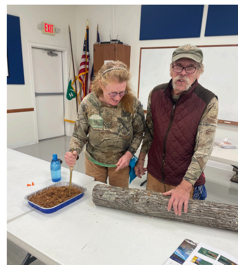
Mushroom Cultivation Session participants working to inoculate their log.