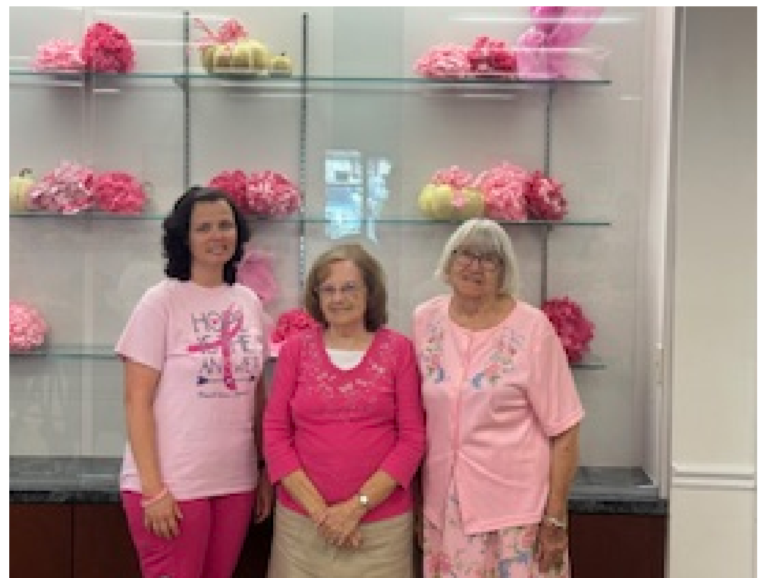
Breast cancer survivors that attended our Breast Cancer Luncheon in October of 2024.

Family and Consumer Agent Days are filled with lots of excitement. We can have the day planned down to the minute and within seconds, the events of the day can change. The Laugh & Learn Program for preschoolers is a great example of this. You never know what’s going to happen, what children this age are going to TELL or ASK you, but you can guarantee it’s something you were NOT expecting!! These little ones are such a great age to be involved with and I actually learn more from them than they do me. It’s never a dull moment. And, without exception, when they are ready to depart, they give lots of hugs and smiles with promises to return to the next session.