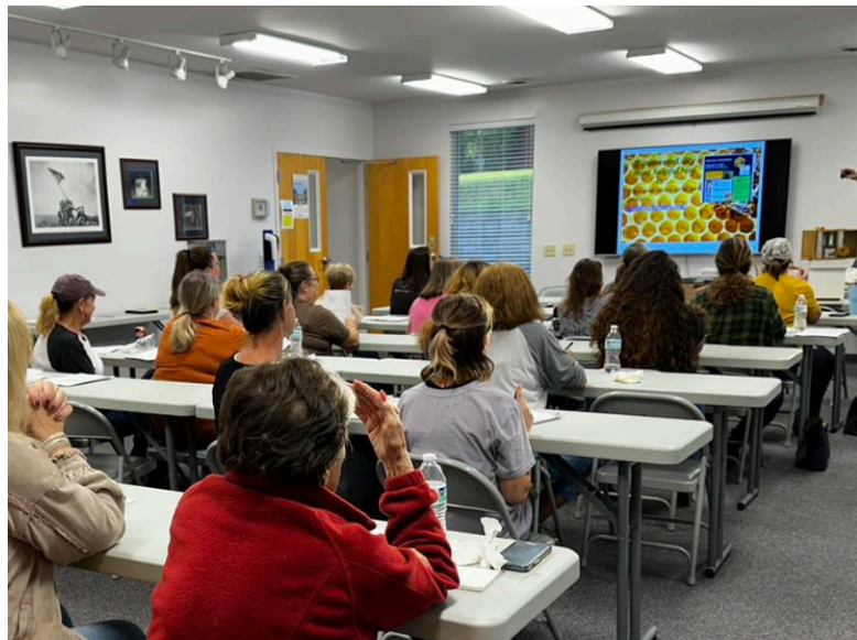
Beekeeping 101 Session participants learning the basics of beekeeping!