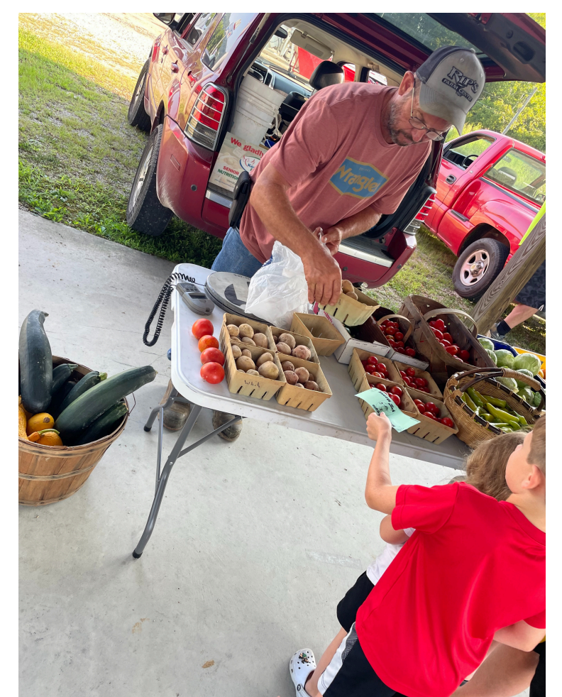
A Kids Bucks participant purchases fresh produce from a Lewis County Vegetable Producer.