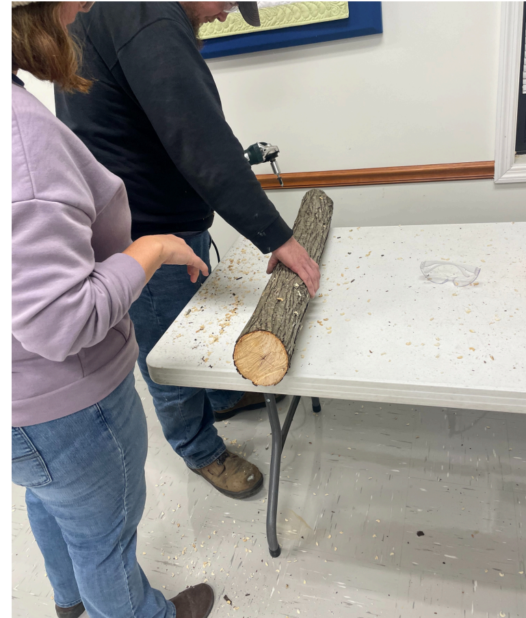
Mushroom Cultivation Session participants getting hands-on by drilling holes in their log.

The Mushroom Cultivation Session gained a lot of interest from the public. In this session, participants were able to drill, inoculate, and seal their own logs for growing mushrooms! This session had an attendance of 42 people and was very successful!