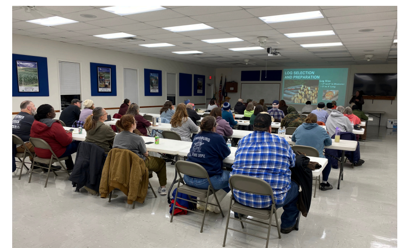
Mushroom Cultivation Session participants learning how to select and prepare their log for mushroom cultivation.