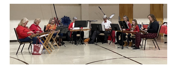
Dulcimer Group Entertains at Homemaker Bazaar

The funds raised through this event stay in the individual clubs. Groups may send a donation to an organization in memory of a lost group member, have a mandatory $50 donation to our local high school scholarship fund, make donations to local fire departments, donations to families in need, and have the freedom to pay for an occasional group's meal.